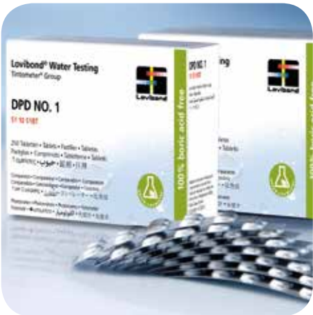
Tablet reagents in blister strip