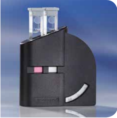
Front view of the CHECKIT® Comparator with cells