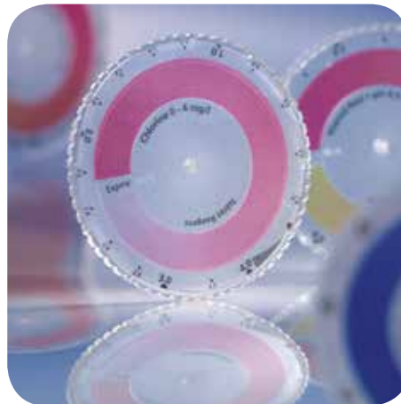
CHECKIT® Discs with continuous colour scales