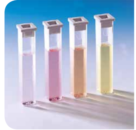
Plastic cells, frosted on two sides, volume 10 ml, path length 13.5 mm, with lid