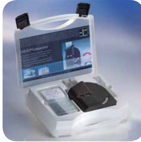
Test Kit complete in case